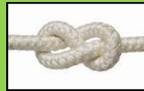
Year 10 Knots display

Our students are creating fabulous things every day. Come in to the library to see what they have been up to.