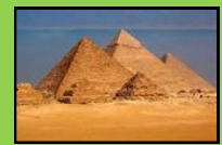
Year 6 Ancient Egypt