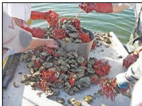
Oysters are grown on the bottom of the bay in the sand & mud