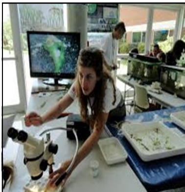
It's all about the Science