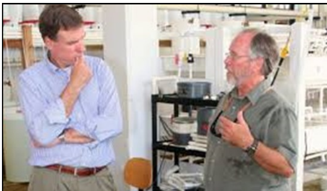
Its always critical conversations