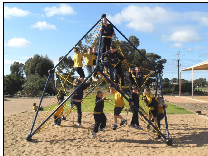
Primary Students enjoying the new playground equipment

"Peace cannot be kept by force. It can only be achieved by understanding" Albert Einstein