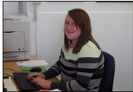
Cert 111 in Business