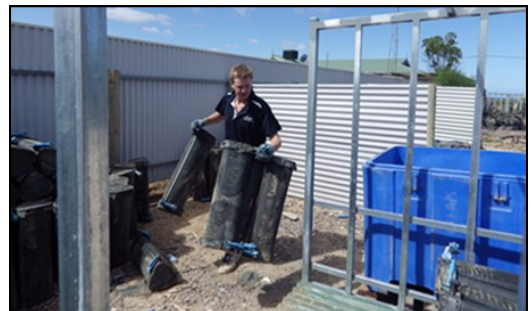
Cert 11 in Aquaculture