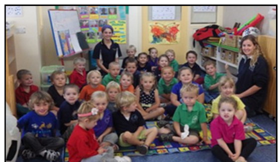
Cert 111 in Children's Services