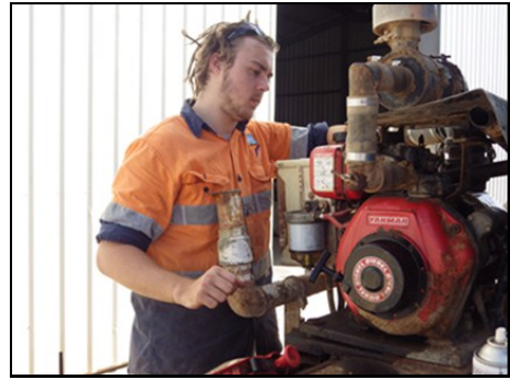
Cert 111 Diesel Mechanic