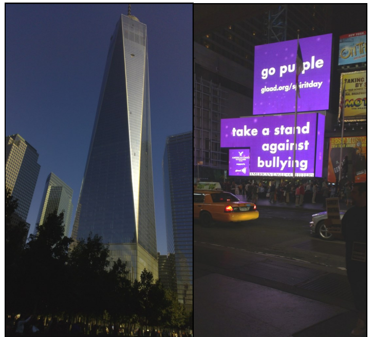
Freedom Tower, New York