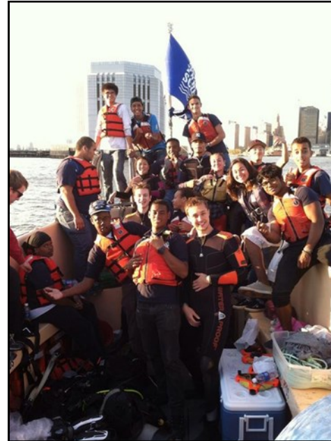
Harbour High Staff and Students off for some truly authentic learning in New York Harbour.