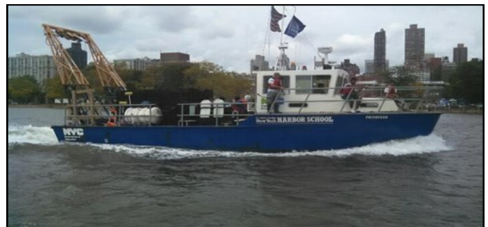
Harbour High School's very own boat!