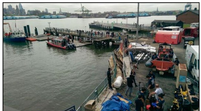
This is the harbour side of the school and their floating wharf. The students are involved in Vessel Ops training, Fire Drill with the New York Fire Department and Marine Systems Training. In the background is the ferry terminal for Governor's Island.