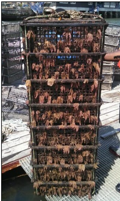
Here are the baskets after two weeks in the water. The oysters are changed and the basket is left to dry out then the weed is brushed off before the basket is reused.