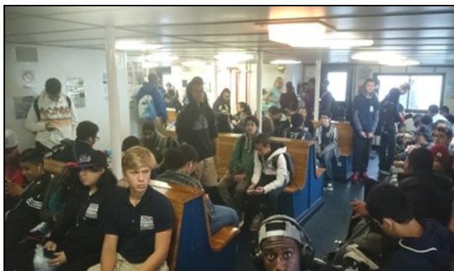
Ferry ride to school