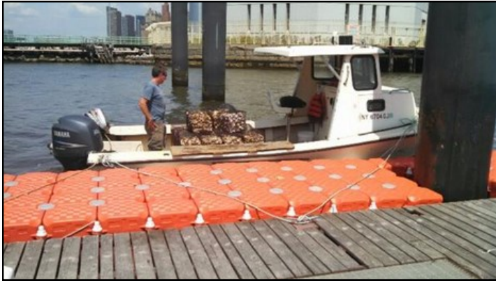
The baskets in the boat are suspended in the water to enable the oysters to filter feed, thus cleaning the water in the harbour.