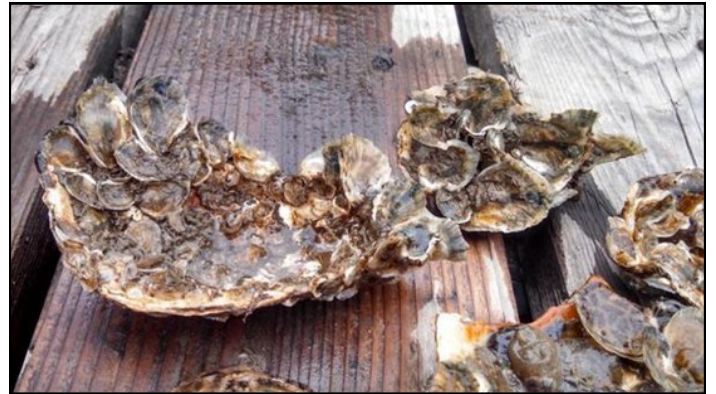
Used and old shells are collected from all around the harbour and reused as beds for spat to attach to. The oysters are only for the repatriation of the Harbour, by removing the toxic waste, not for eating.