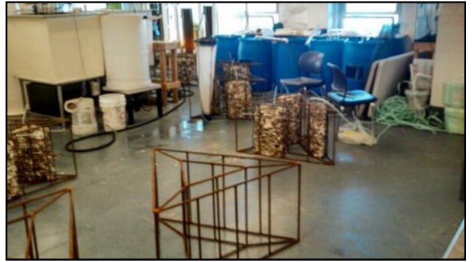
A classroom area turned into a lab for the production of spat.