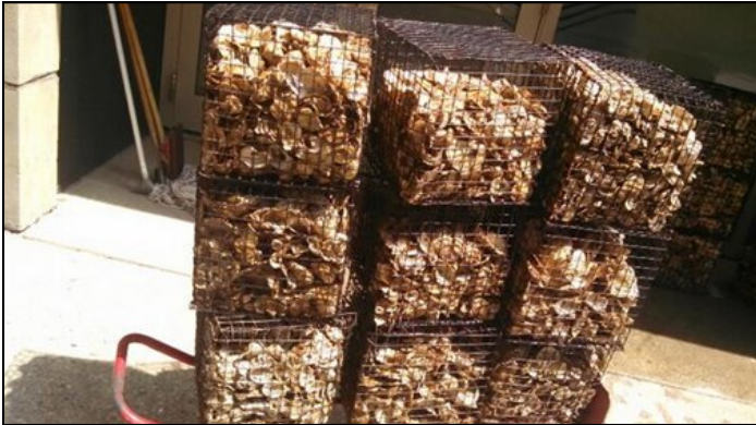
Here are the baskets up close. Much different from anything we do!