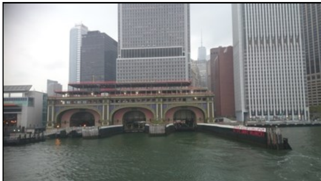
The Ferry Terminal to and from Governor's Island.

The oyster industry worldwide is relatively small and so many people know each other or know of each other's work across many countries. Industry at every level is looking for young people to work in the Industry through Science and research, oyster leases, repatriation of damaged areas either through poor management or through natural disasters. We knew it before from our work with our friends from Japan but now know that there are many opportunities for our students to enter this industry and have a life-long career. Please enjoy a small snapshot of all the people we met and interacted with at Harbour High School. Next week VIMS.